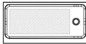
Shaded area represents anti-slip coverage